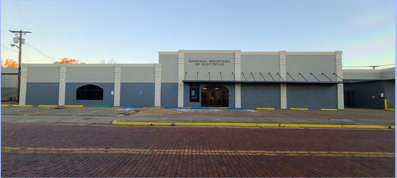
Administration Building Locust Street Tyler, Texas