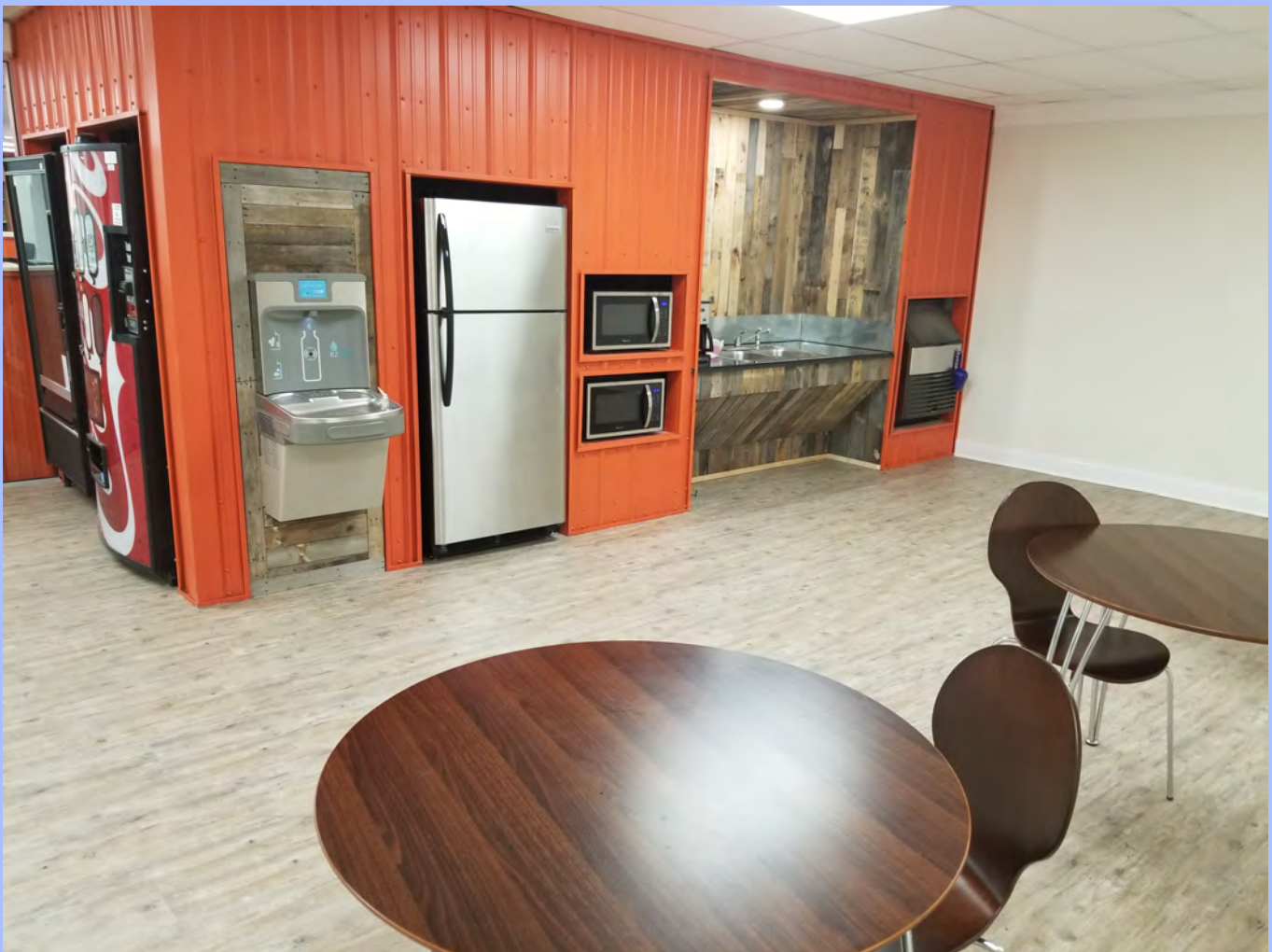
Remodeled Administration Break Room