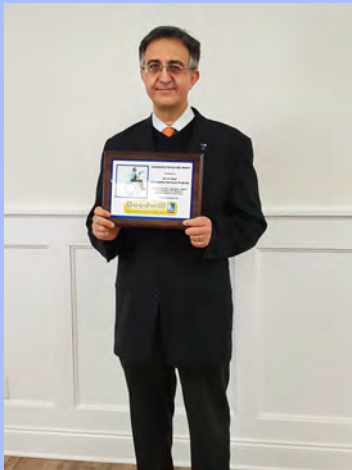
University of Texas at Tyler Community Outreach Program