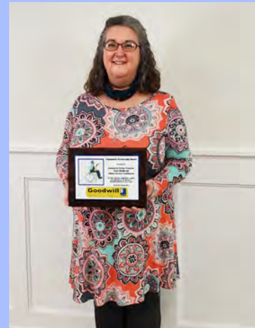
Community Partner Program, Texas Health and Human Services Commission

UT Tyler is proactive, working with Goodwill to open doors to educational opportunities and academic success so that each person can realize their potential.